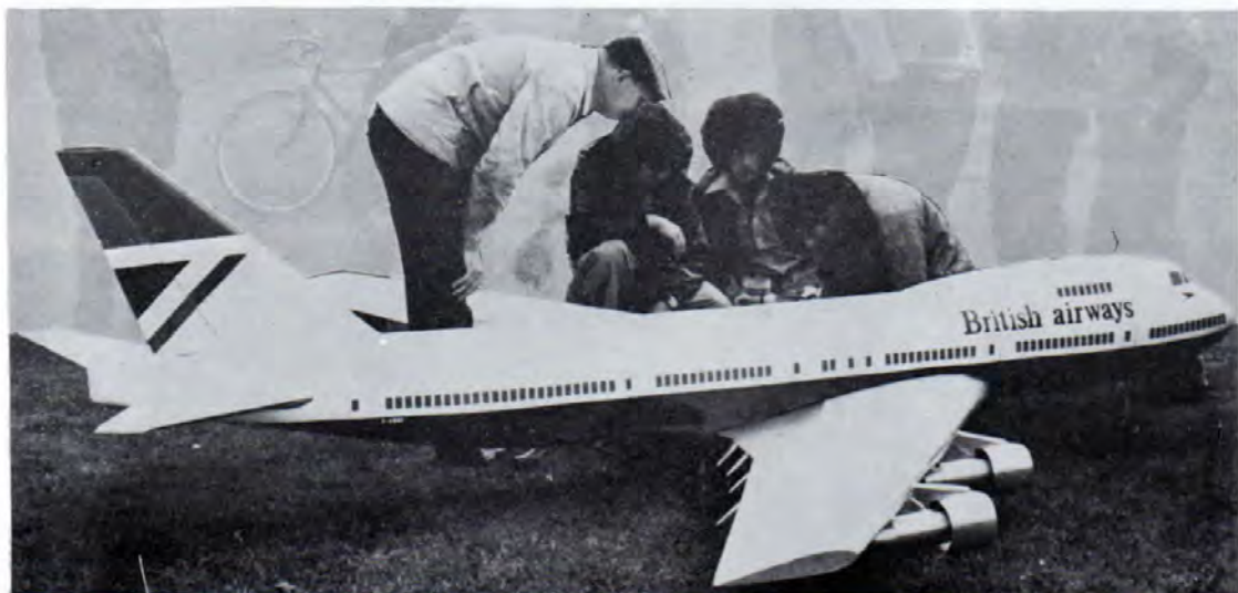
The magnificent model of the Jumbo Jet which stole the show at Southport